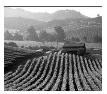
Helping people build a better community and change lives